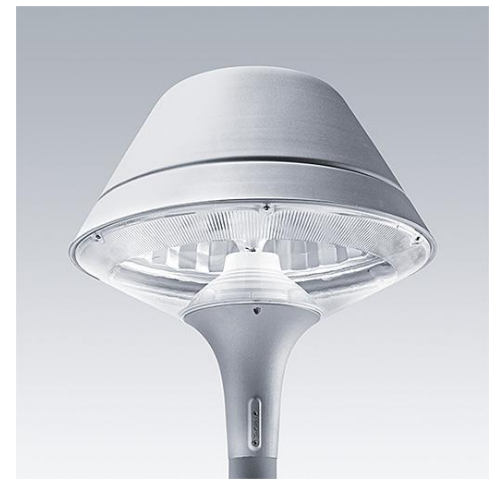
Photographs, line drawings and photometric data are representative only. For specific product detail please select an individual product.