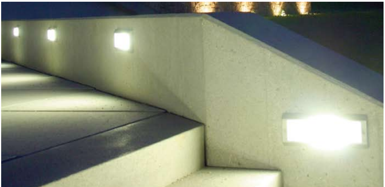
Arachon, Wine Cellar, Austria