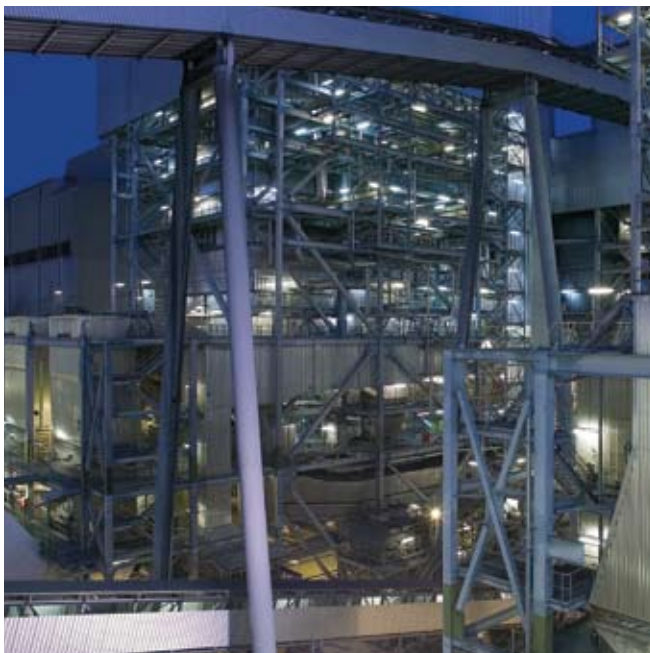
Callide, Gladstone, QLD