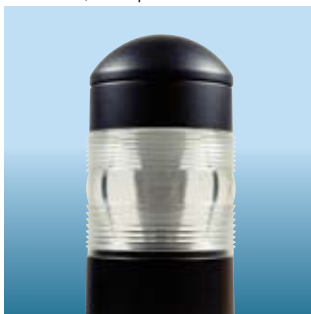
Domed head, black finish