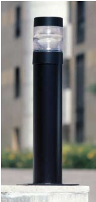
Fresnel lens, black painted finish

To specify state: Circular section aluminium bollard with louvred/fresnel lens head. Root/flange mounted. As Thorn Chartor.