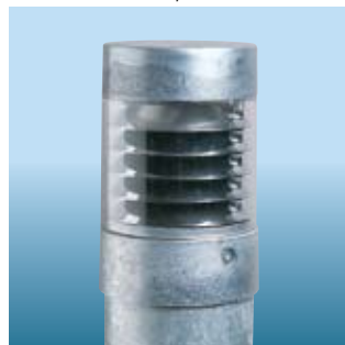
Mirror optic, unpainted finish