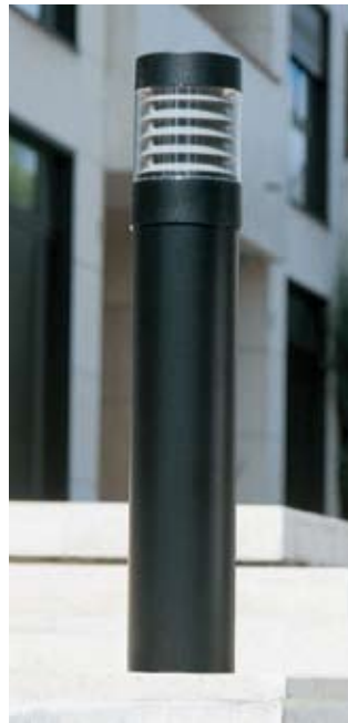
Internal louvre, black painted finish