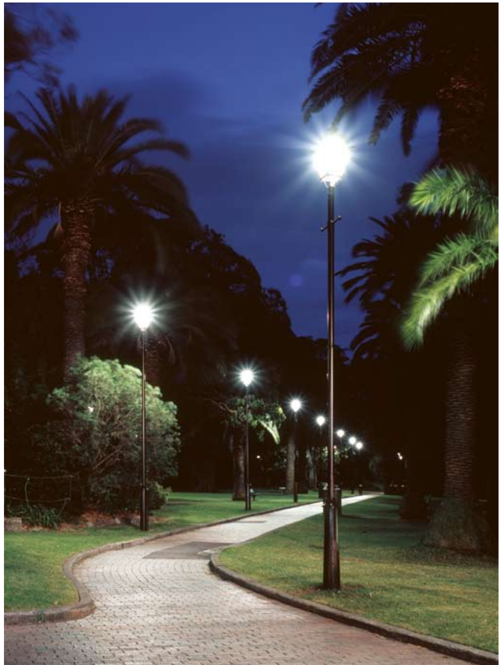
Burwood Park, Burwood, NSW