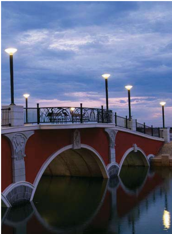
Mariners Cove Estate, Mandurah, WA

To specify state: Elegant 340mm diameter 1200mm/1800mm conical bollard in cast aluminium for indirect lighting. IP54. As Thorn Madison Bollard Wall mounted luminaire in cast aluminium for indirect lighting. IP54. As Thorn Madison Wall.