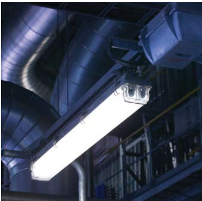
Callide, Gladstone, QLD