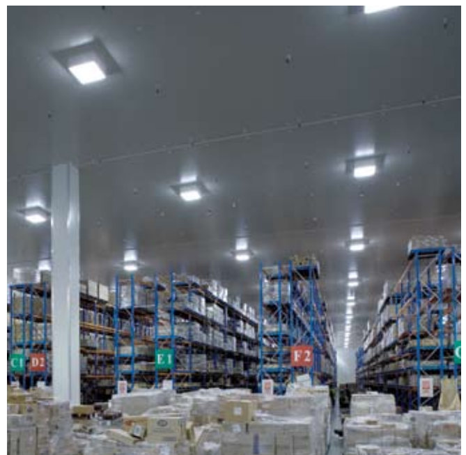
Melcash Distribution Centre, Cresmead, QLD