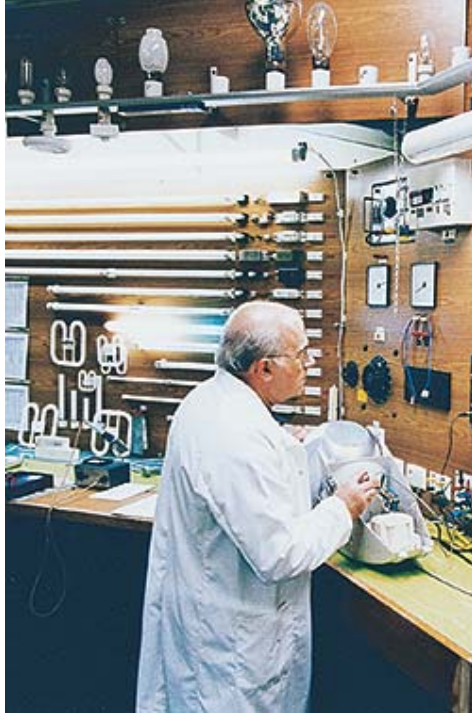
Electrical component safety check

The Thorn lighting laboratory is certified to AS/NZS/ISO9002 and is NATA accredited for various electrical tests on luminaires. Other testing includes photometric, general electrical and electro magnetic compatibility (EMC), which ensures luminaires produce a minimum amount of excess energy. It also determines luminaire LOR efficiency using an integrating sphere with reference lamps. Plastic components and metalwork is also evaluated to ensure quality and benchwork performances including general suitability and longevity. Lamp rack ageing, starter switch and ignitor operating performance parameter testing is on-going.