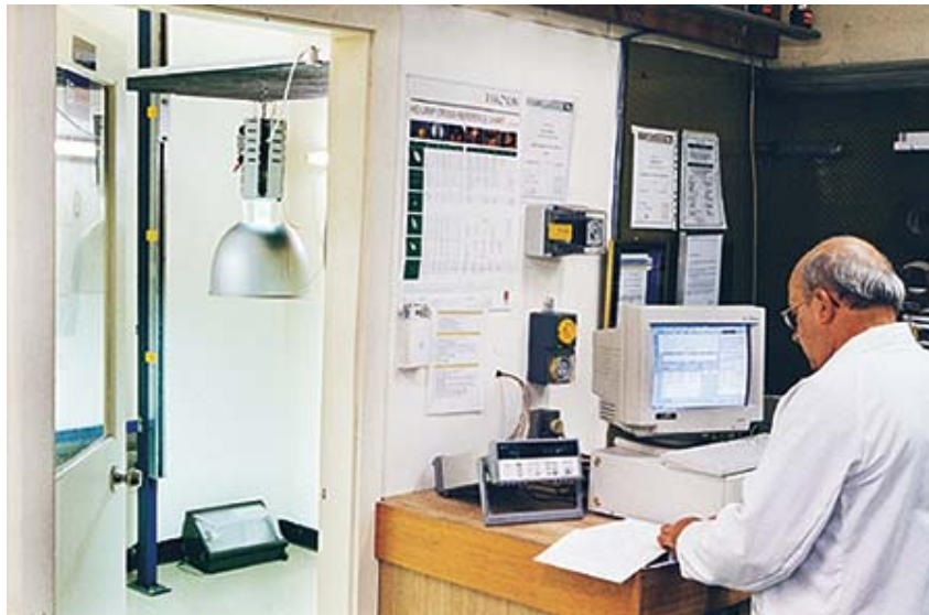
Thermal testing of a BHB to determine its permissible operational ambient.