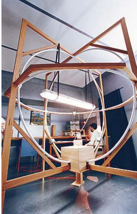
EMC (electro magnetic compatibility) testing of the Europroof, in a highly specialised rig for C-tick compliance.

On the 1st of January 1999, the Federal Government introduced mandatory requirements for electro magnetic compatibility (EMC), which aim to prevent further pollution of Australia's electro magnetic spectrum. The new requirements mean all electrical products must emit a minimum amount of electro magnetic radiation.