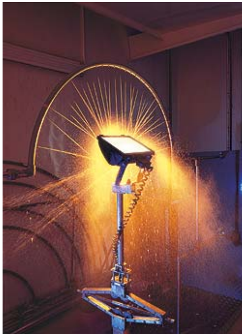
A Haline floodlight undergoing an IP rating evaluation.

The laboratory bases its quality system on the requirements for NATA accreditation, ISO guide 25 for laboratories and the AS/NZS/ISO 9002 standard. Tests confirm new product developments and are also used to improve existing luminaires. The laboratory also conducts quality assurance testing and investigates field difficulties and service issues in order to maintain consistent standards.