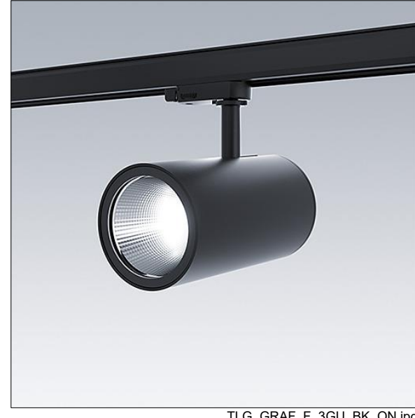
TLG GRAF F 3GU BK ON.jpg