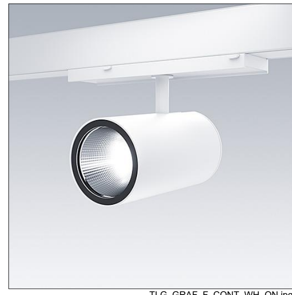
TLG GRAF F CONT WH ON.jpg