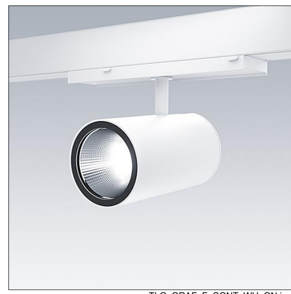
TLG GRAF F CONT WH ON.jpg