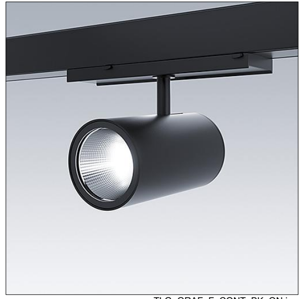
TLG GRAF F CONT BK ON.jpg