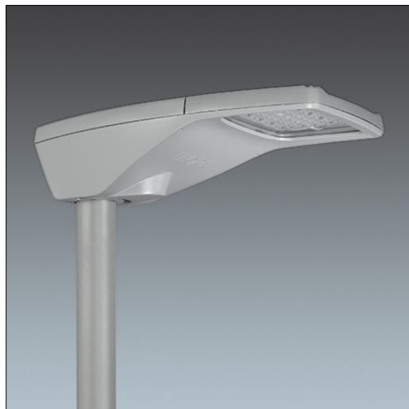
TLG R2L2 F SPDB.jpg