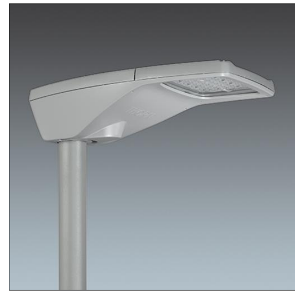
TLG R2L2 F SPDB.jpg