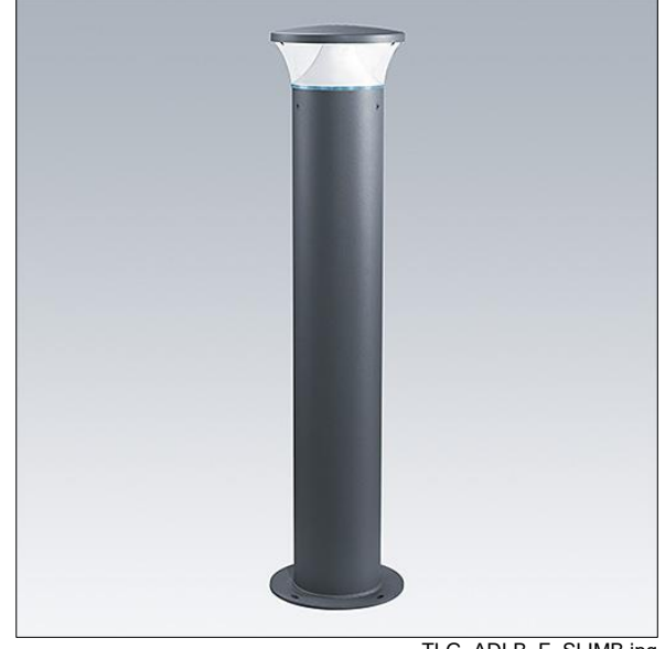
TLG ADLB F SLIMB.jpg