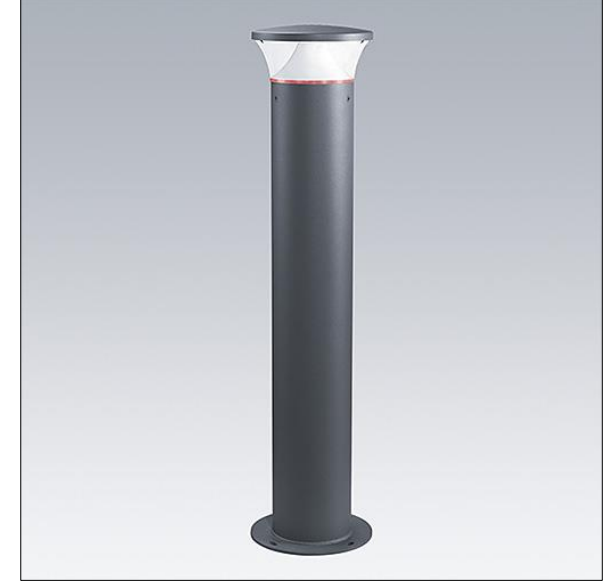
TLG ADLB F SLIMR.jpg