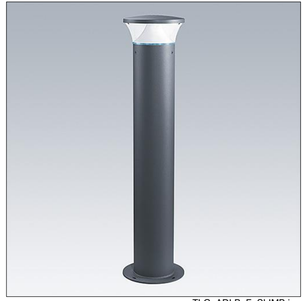
TLG ADLB F SLIMB.jpg