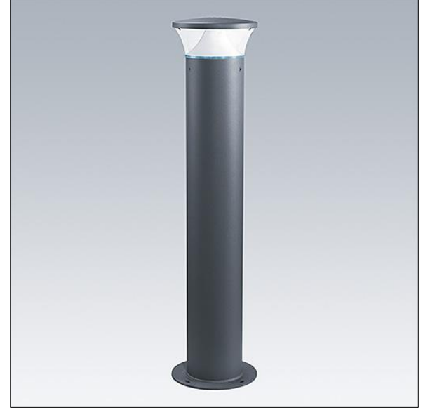
TLG ADLB F SLIMB.jpg