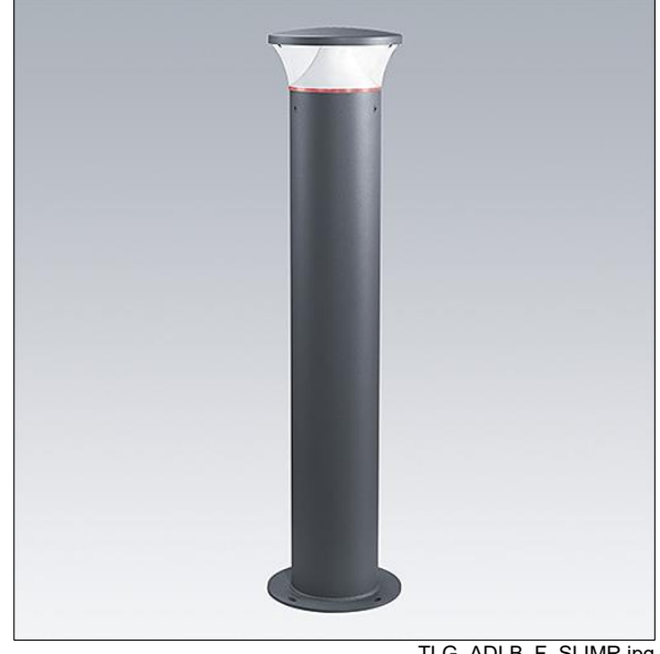
TLG ADLB F SLIMR.jpg