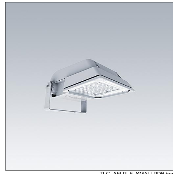
TLG AFLP F SMALLPDB.jpg