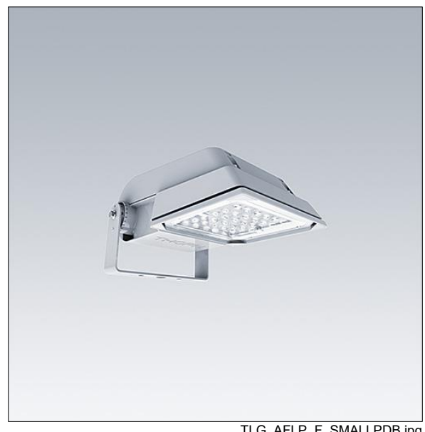
TLG AFLP F SMALLPDB.jpg