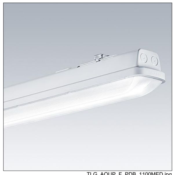
TLG AQUP F PDB 1100MED.jpg