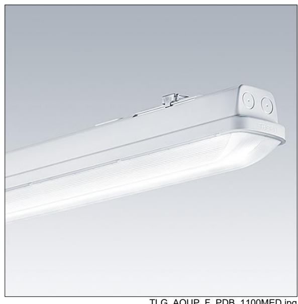
TLG AQUP F PDB 1100MED.jpg