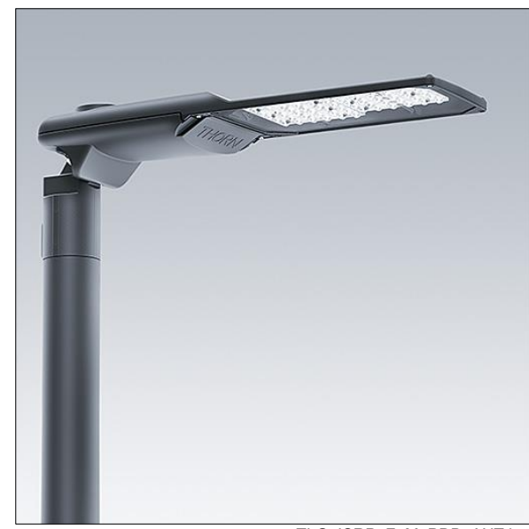
TLG ISRP F M PDB ANT.jpg