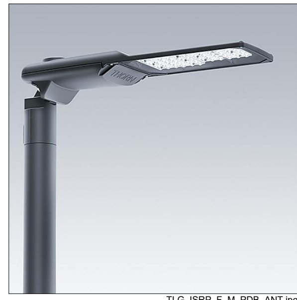
TLG ISRP F M PDB ANT.jpg