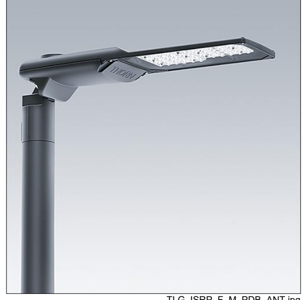
TLG ISRP F M PDB ANT.jpg