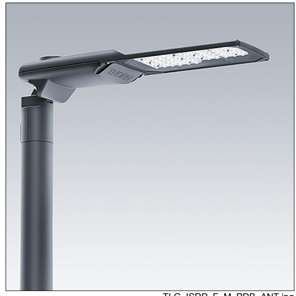
TLG ISRP F M PDB ANT.jpg