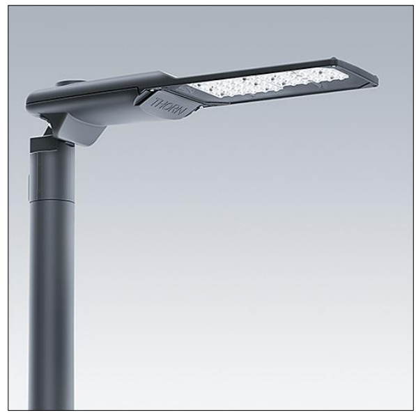
TLG ISRP F M PDB ANT.jpg