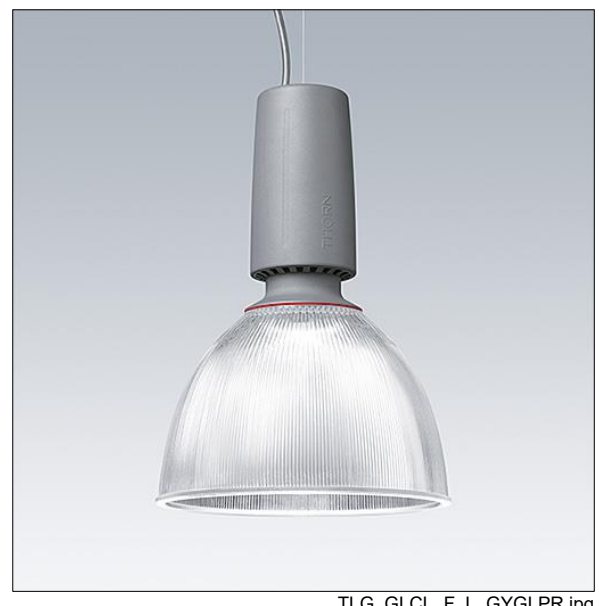
TLG GLCL F L GYGLPR.jpg