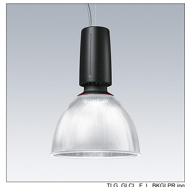
TLG GLCL F L BKGLPR.jpg