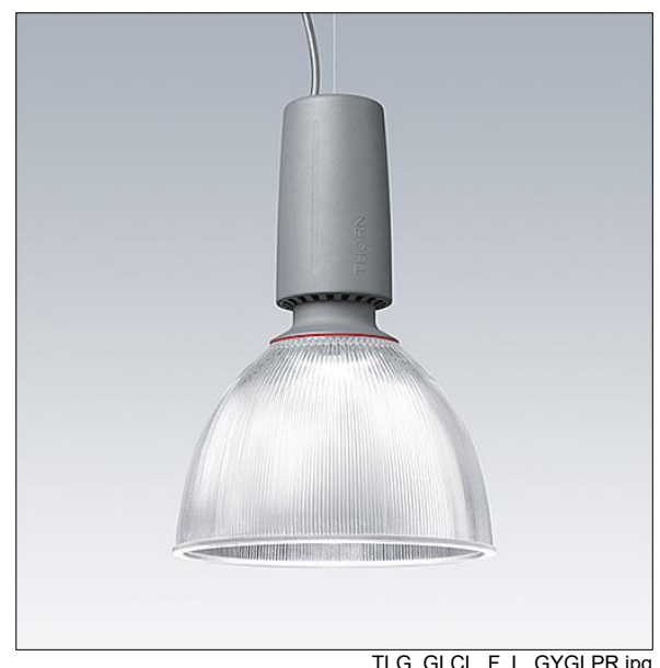
TLG GLCL F L GYGLPR.jpg