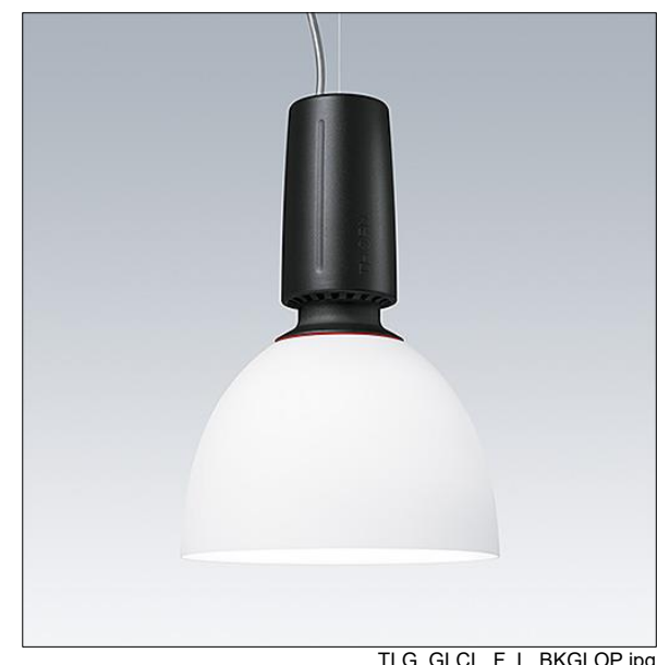
TLG GLCL F L BKGLOP.jpg