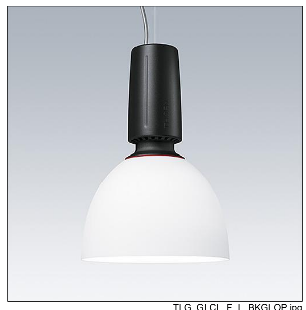
TLG GLCL F L BKGLOP.jpg