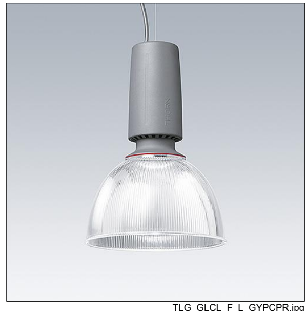
TLG GLCL F L GYPCPR.jpg