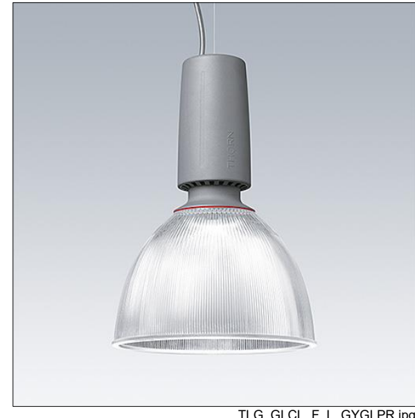
TLG GLCL F L GYGLPR.jpg