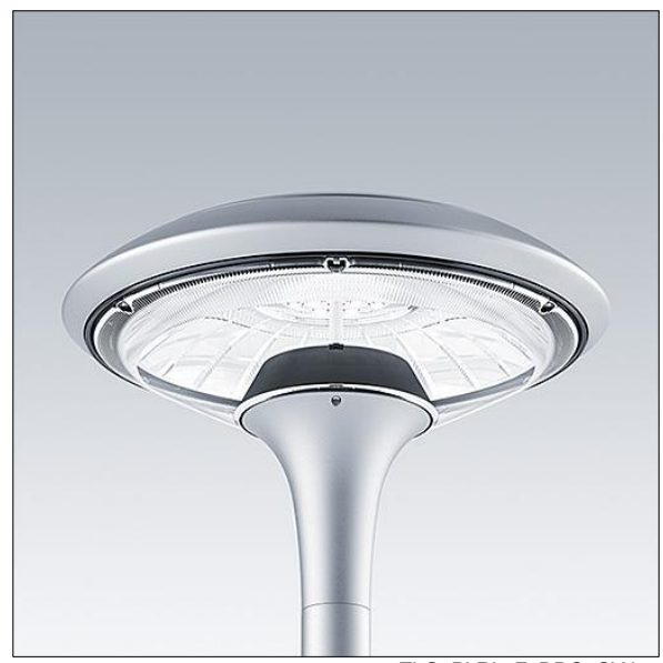
TLG PLRL F DDC GY.jpg