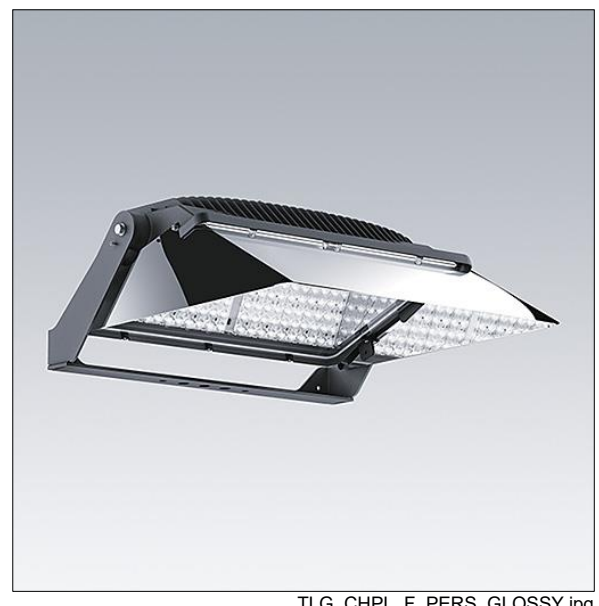
TLG CHPL F PERS GLOSSY.jpg

Weight: 22.4 kg Scx: 0.196 m<sup>2</sup>