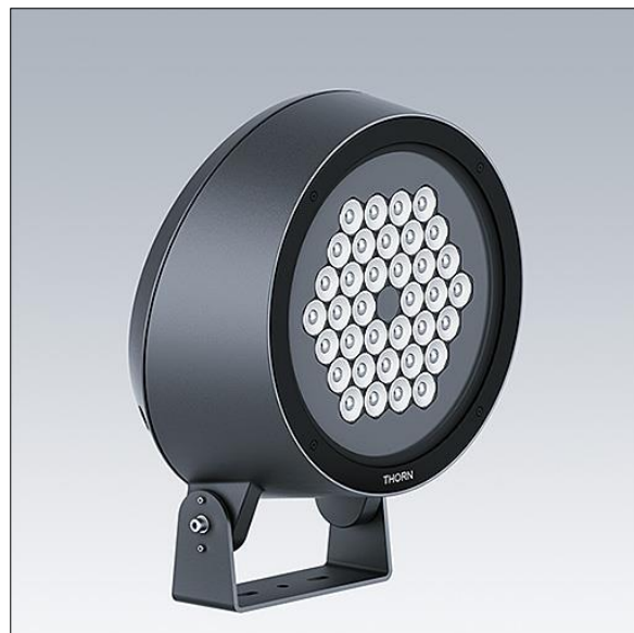
TLG CON3 F M 36L.jpg

Dimensions: Ø397 x 206 mm Luminaire input power: 118 W Luminaire luminous flux: 11427 lm Luminaire efficacy: 97 lm/W Weight: 13.2 kg