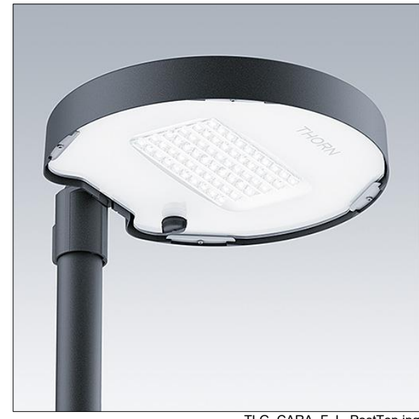
TLG CARA F L PostTop.jpg