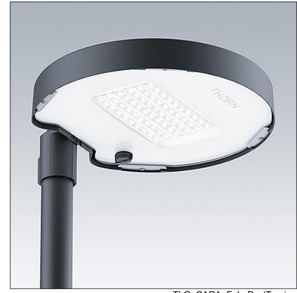
TLG CARA F L PostTop.jpg