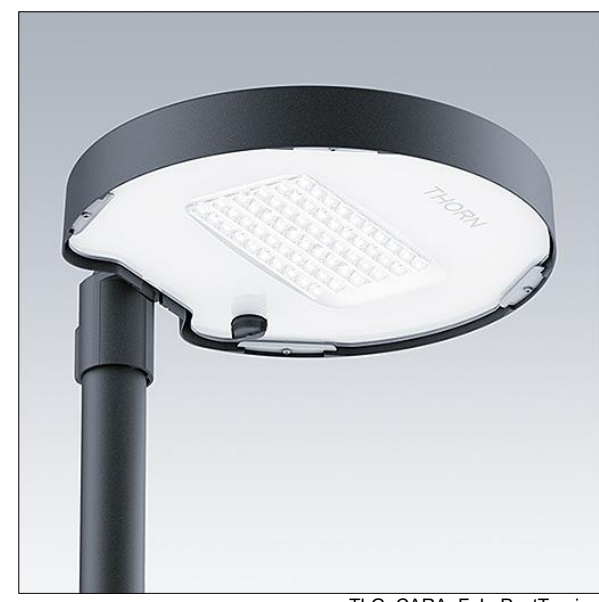
TLG CARA F L PostTop.jpg