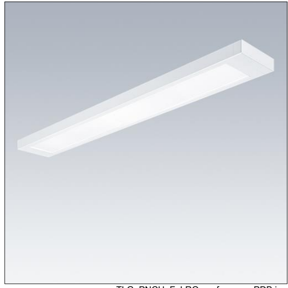
TLG PNCH F LRO surface on PDB.jpg