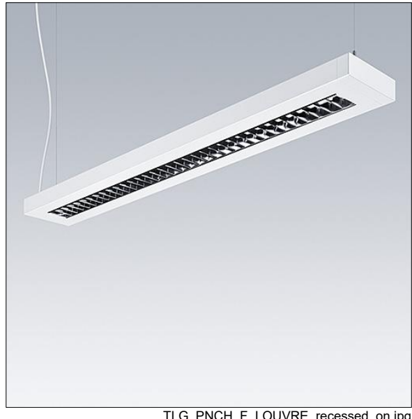
TLG PNCH F LOUVRE recessed on jpg