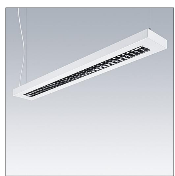
TLG PNCH F LOUVRE recessed on jpg

Dimensions: 1581 x 162 x 56 mm Luminaire input power: 48 W Luminaire luminous flux: 6560 lm Luminaire efficacy: 137 lm/W Weight: 3.5 kg